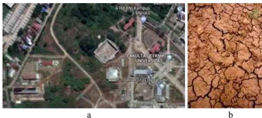
Figure 1. (a) Soil sample quarry (b) clay soil visualization.

The quarry of soft soil samples using in this research was excavated from the University of Hasanuddin development site in Gowa as shown in figure 1a. Visually, soil samples colored with reddish-brown with a fine grain as shown in figure 1b. The basic properties analysis of soil presented that the soil classified as clay with high plasticity (CH) based on USCS standard. Properties of soil presented in table 1. Figure 2 shows the result of the sieve analysis. The general properties of laterite soil can be classified into the A-7-5 group according to ASTM D-427.98 [6].