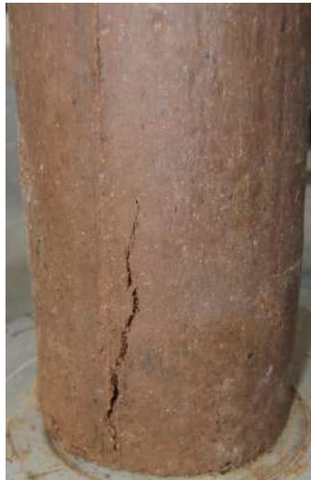
Figure 5. Morphology of Specimens After Compressive Test.

Based on figure 5 it can be seen that the maximum stress obtained from the compressive strength of the clay used in the research of the open channel scour model is 0.95 \text{ kg/cm}^2 . The specimen illustrates that the compression stress of treated soil increased with an increase in axial strain up to a certain peak. After reaching the peak strength, the unconfined compression stress was stable while the axial strain increase and strain softening occurred prior to fracture. It is evident that treated soil with lime and cement has ductile behavior in compression.