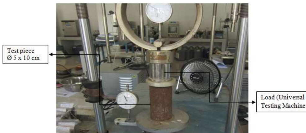
Figure 3. Equipment of UCS test in a laboratory.

UCS test was conducted according to SNI 03-6887-2002 [7]. Figure 3 shows the UCS test in the laboratory. The soil samples for UCS test were prepared using cylindrical molds, which have an inner diameter of 5 mm and a height/diameter ratio of 2.0 for reducing the end effects during UCS testing. Three replicates of each sample set were prepared to assure reproducibility.